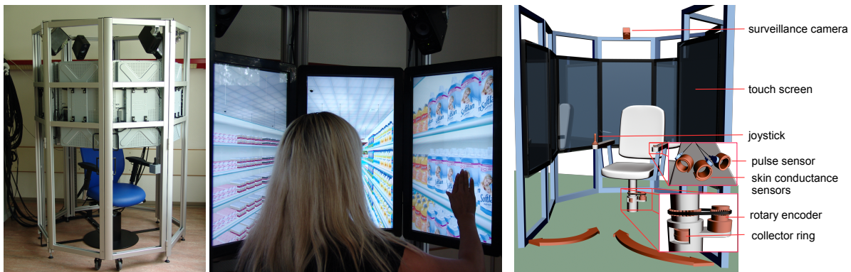
Figure 1: Two photographs and a simplified illustration of our OCTAVIS virtual reality (VR) system. Eight screens, arranged in an octagon, provide a 360° panorama visualization of the virtual environment. Two door segments can be opened. Navigation in the VR is performed through a modified office chair. Its orientation determines the movement direction. A “throttle joystick” in the armrest controls the movement speed. Easy and natural interaction with objects is enabled through a simple touch screen interface. Biosensors and surveillance cameras permit permanent patient observation by clinical staff.

4 Neurobiology & Genetics of Behavior, Witten Herdecke University